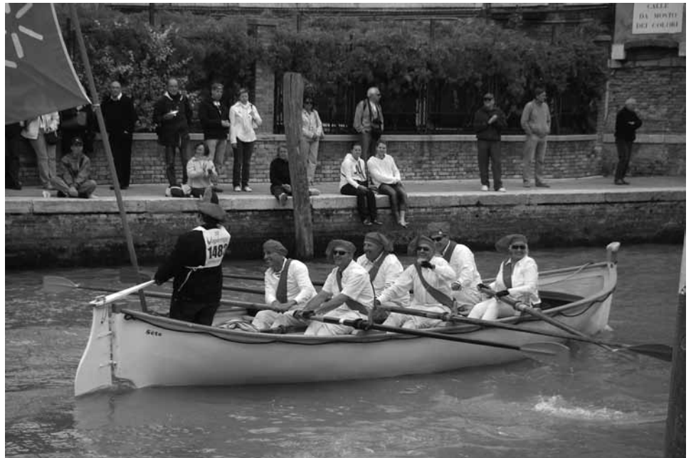
Team Toque: I have no idea how they finished but am certain they ate well.

After four or five hours of Hydrocodonal sleep, or coma, I awoke pain-free, and there was nothing for it but to spectate rather than participate. The best places for that are the Rialto and Accademia bridges over the Grand Canal, and especially the first bridge over the Canareggio. That's where the great traffic jam occurs, usually caused by the coxed eights. These needle-narrow racing shells mount four 12-foot