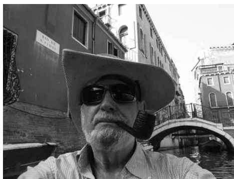
Bill on the Rio del S Vidal, which connects with the Grand Canal.

the tail of Venice, north past such islands as Sant'Erasmus, Venice's produce garden; Burano, famous for its lace and fiercely painted houses; and then Torcello, with its 11th Century cathedral and Byzantine mosaics. From there south on a long reach to Murano, domain of glass-makers; and another long stretch to the Canale di Canareggio, which repays sweat with glory: a left turn at the end begins the gaudy palazzo-lined procession down the Grand Canal to