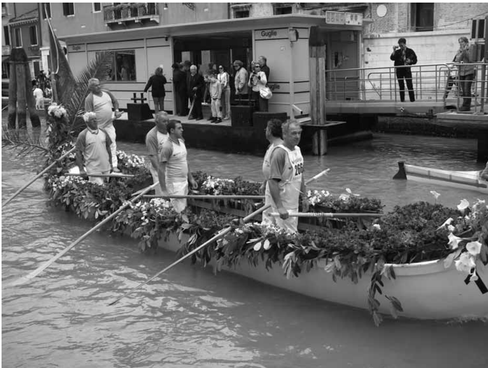
A floral and festive entrant.

war canoes; the odd paddle boarder and things deserving the label UFO: unidentifiable floating object. That diversity fosters even more. Many women now enter (there are several all-woman crews); all ages; all races. Rowers include ego-driven racers;