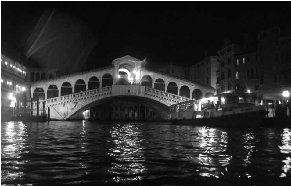
A midnight transit of the Grand Canal: Rialto Bridge ahead.

project, which is to have paddled every inch of every canal in Venice and her islands. I've been working on it a few years now, and am halfway there. I made several long passages along the northern side of the city, went west to experience the canal's only traffic light, pulled over to Osteria da Simson, which offers the local drive-thru: canalside service. I traveled the Grand Canal end to end, which is perfectly safe if you keep your wits about you and stay well away from vaporetti at boat stops. (Especially never crowd the stern of a vaporetto; its propeller generates powerful vortices that will spin you like a top.) And then I consulted Scarpa. Sage and sachem of Venetian rowing, teacher thereof and champion of many races, Paolo mused into his mustache and gave me three words: Vai da sera . Go by night.