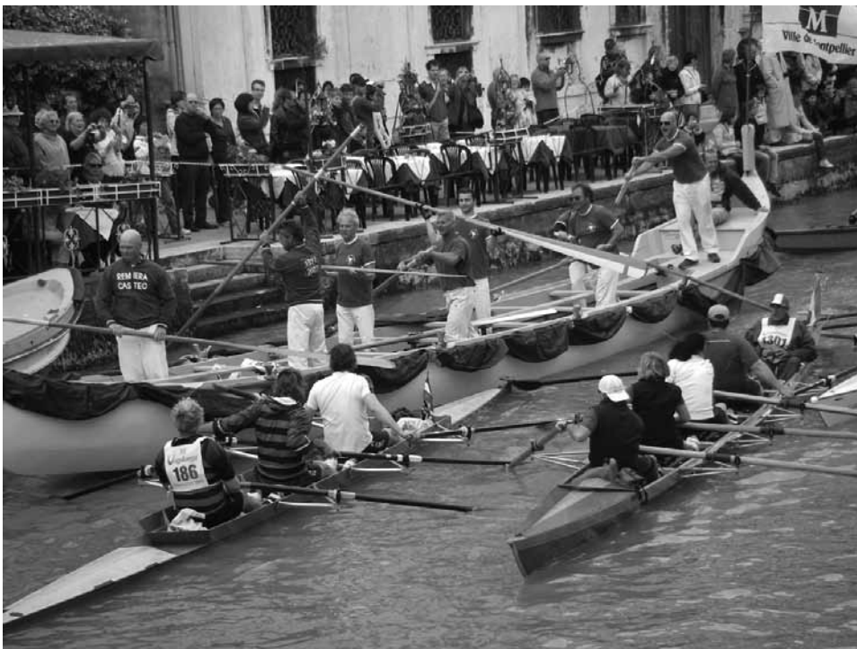
The DNA of the traffic jam: long oars, many boats, amateur rowers.