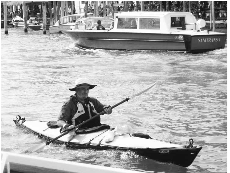
On the Grand Canal: daylight reconnaissance in heavy traffic.