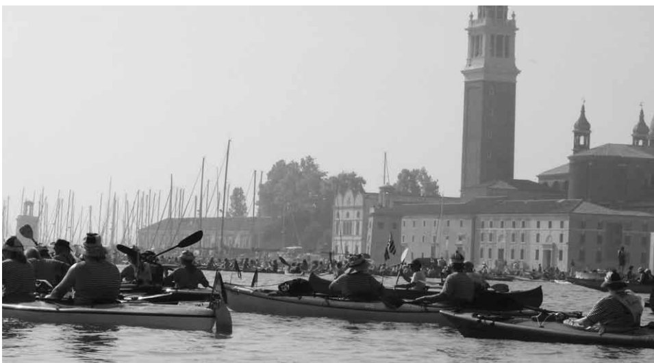
Paddlers gather near the mouth of the Grand Canal with the campanile of San Giorgio Maggiore in the background.

They did. May 8, 1975 found about 1,500 people in 500 boats thronging the basin of St. Marks, and to the surprise of those who called Venetian rowing a moribund art, almost all the boats were Venetian types Venetianly rowed: gondolas, of course, but also Veneta a Quattros, batellas, caorlinas, sandolos, mascarétas, pupparins, dodesonas, disdotonas, s'ciopons, mussins, gondolinos, viperas, balotinas, batela a coa de gambaros, and barcariòls. A cannon boomed them off on a course, 32 kilometers or just shy of 20 miles long, that amounted to a grand tour of the Northern Lagoon. It led and still leads east around