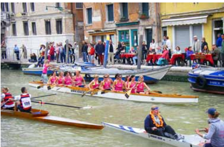
One of the more photogenic entries.