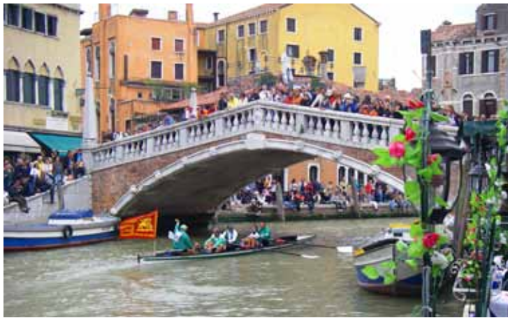
Five minutes later traffic was so thick you could barely see the water.